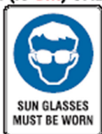
SS772 BM 300x450 AE, AM 450x600