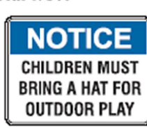
N483E CP, CM 225x300