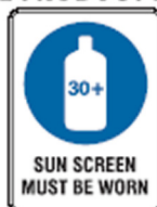
SS778 BM 300x450 AE, AM 450x600