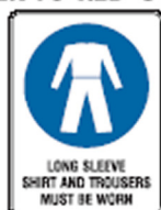
SS770 BM 300x450 AE, AM 450x600

REFER TO RED CODE: (ie BM ) UNDER IMAGE IN OUR PRICE LIST FOR COMPLETE PRODUCT DESCRIPTION