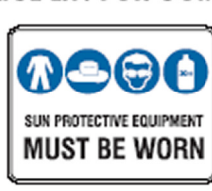
SS776 AE, AM 450x600