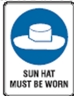
SS774 BM 300x450 AE, AM 450x600