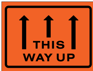
Size 100mm x 75mm Roll of 500 labels Code: LABP320