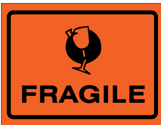
Size 100mm x 75mm Roll of 500 labels Code: LABP300