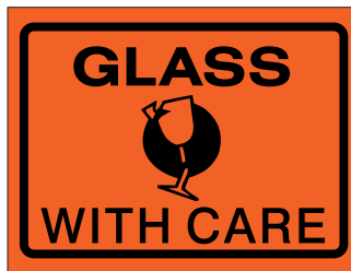
Size 100mm x 75mm Roll of 500 labels Code: LABP305