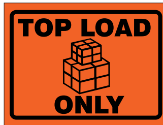
Size 100mm x 75mm Roll of 500 labels Code: LABP325