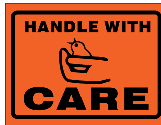
Size 100mm x 75mm Roll of 500 labels Code: LABP310