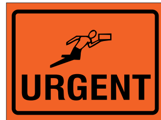
Size 100mm x 75mm Roll of 500 labels Code: LABP330

These self stick paper labels come in rolls of 500 , highly visible in fluorescent colours. Each colour label has a weight class (see left) to minimise "Weight Related" workplace injuries and improve workplace safety.