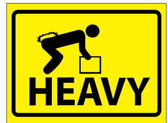
Size 100mm x 75mm Roll of 500 labels Code: LABP315